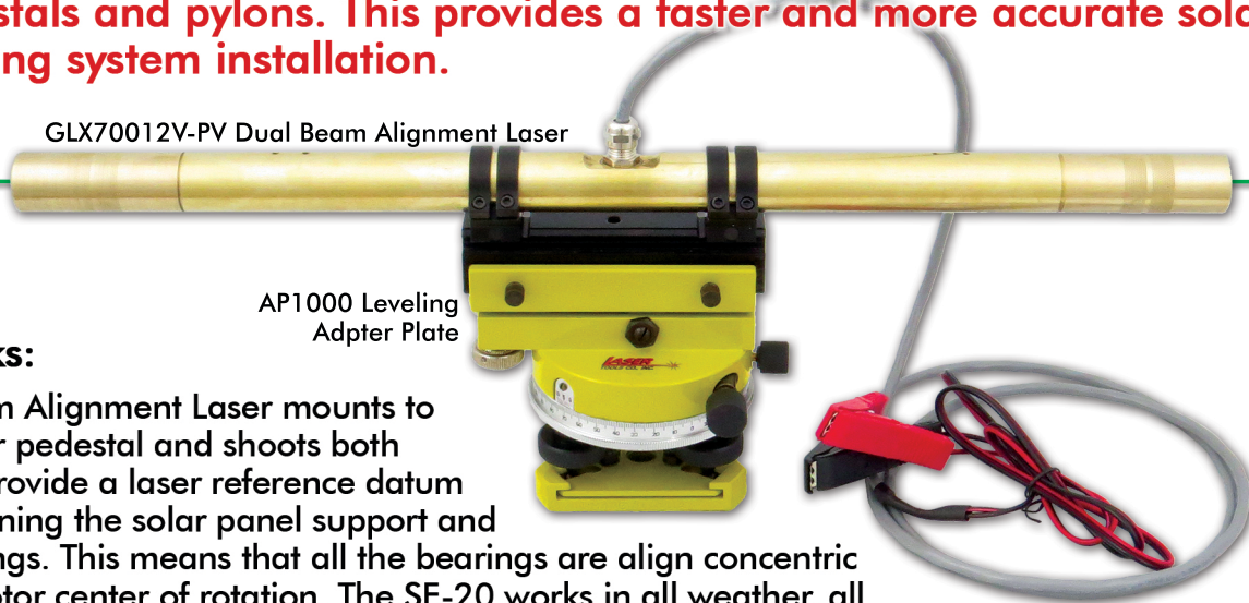
AP1000 Leveling Adapter Plate