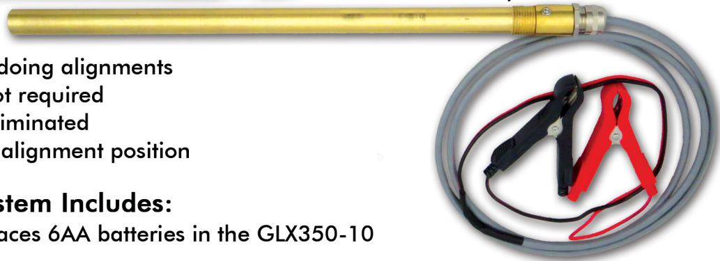
BE9V Battery Eliminator

The SPS-30 Solar Power System converts sunlight into 12V DC power. This powers the GLX350-10 Green Beam Solar Energy Installation System Lasers.